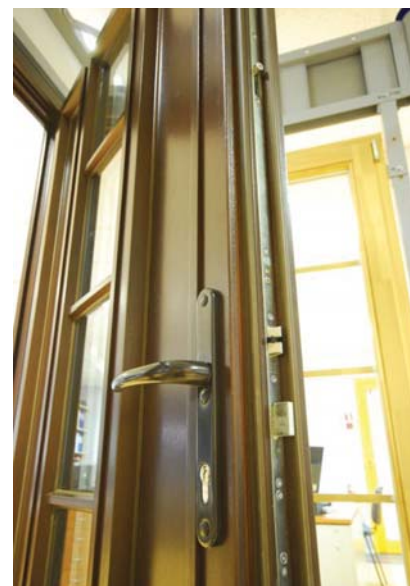
Okoume entrance door