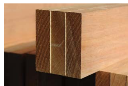
Glued okoume timber scantling